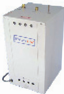
PBU Undersink Boiler