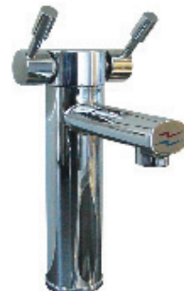
Fully automatic instant filtered boiling and chilled water dispenser